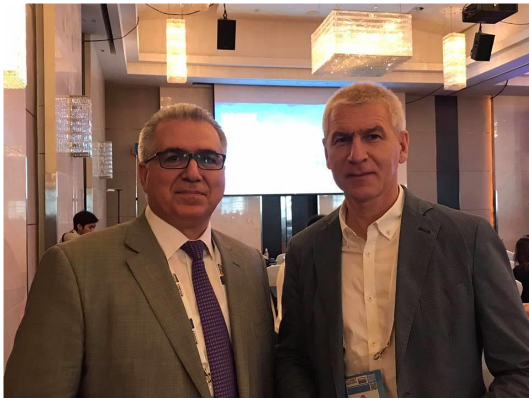
Meeting and discussion with China Ministry of sport which immediately lead to participation of china Kickboxing Association in Asian Kickboxing Championships 2018 in Kyrgyzstan.